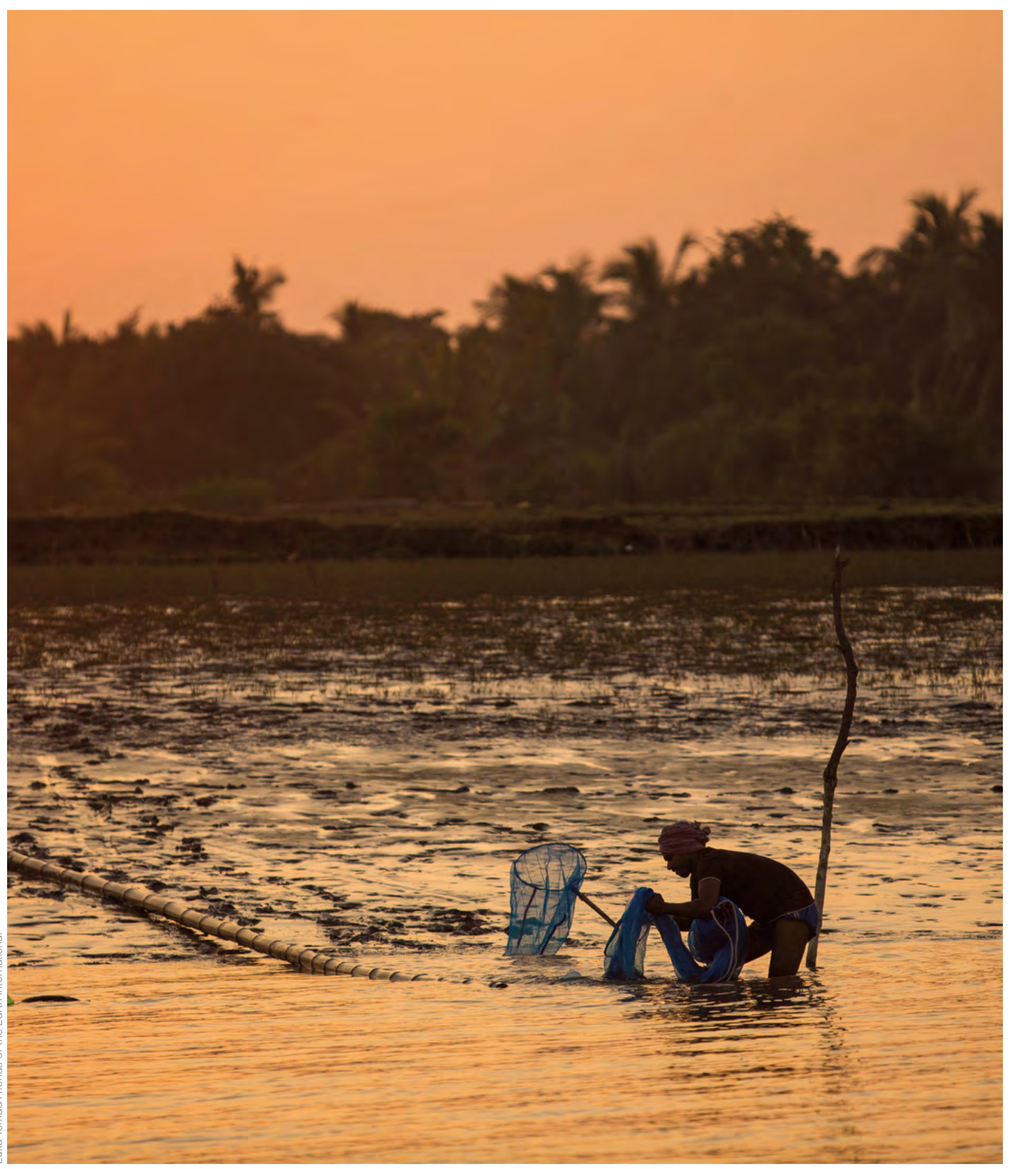
Fisherfolk in Rampal, Bangladesh