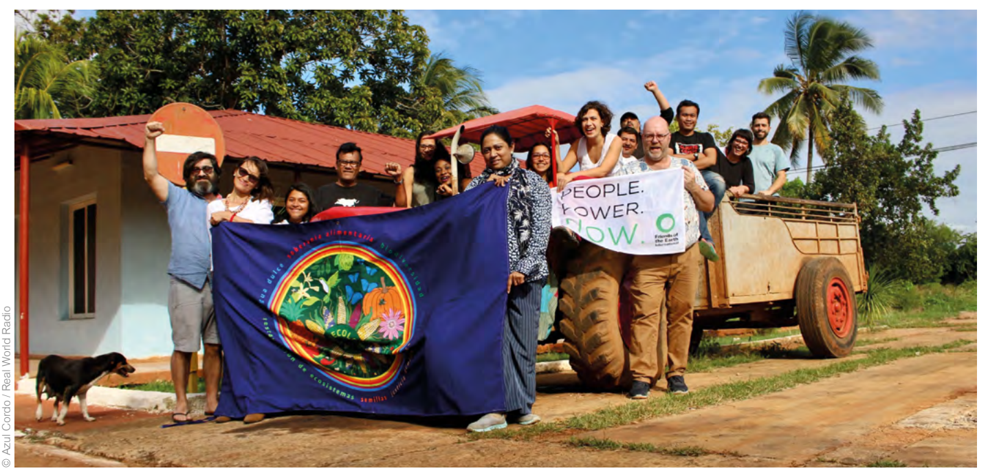
La Via Campesina's 7th International Agroecology Meeting, Cuba.

The Declaration is now in force and can be effectively used to protect peasants' rights and further recognition of collective rights. The actionable points contained in the Declaration are primarily directed at State obligations, and it is our role to ensure its implementation through widespread awareness of the Declaration among peasants and rural communities, and civil society actors that can exert pressure on governments.