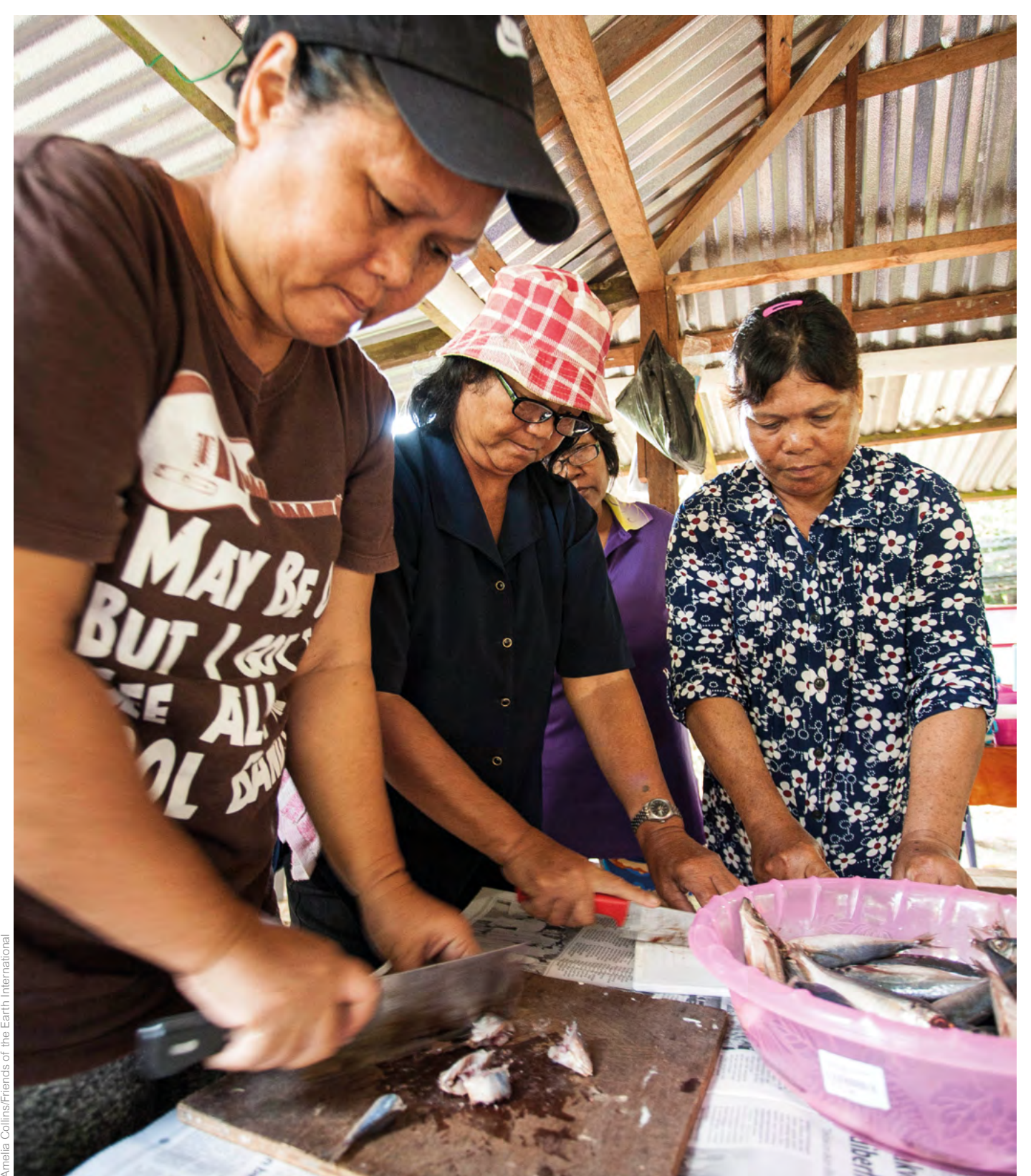
Women taking part in an agroecology training programme, Sarawak, Malaysia