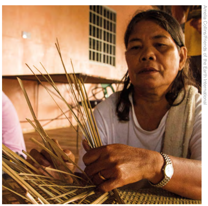
Woman from the Sungai Buri community, weaving mats, Sarawak, Malaysia

The power of these instruments remains in the collective exercise of rights in the territory, and so constant education efforts to ensure right holders are aware of the Declaration and can find ways to leverage it in their local struggles is the most essential action to take.