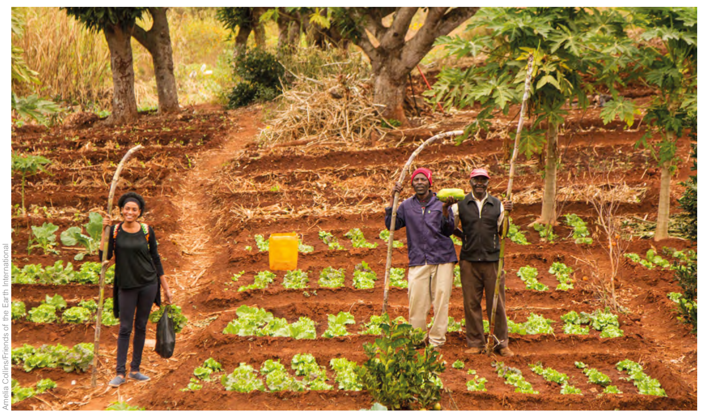
Community members holding sugar cane on small holding plot outside Namaacha Mozambique

Although peoples' collective rights are violated around the world, the very concept of collective human rights has been contentious among human rights institutions and scholars. The inclusion of collective rights in UNDROP, building on the UN Declaration on the Rights of Indigenous Peoples and legal interpretations from UN Treaty Bodies, strengthens the international human rights architecture and clarifies common misconceptions about the validity of collective rights.