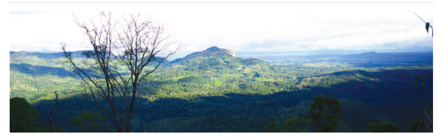
Mabu forest in central Mozambique.

Some amount of carbon removal will be required to keep warming below 1.5°C, to address residual emissions from sectors such as agriculture that will not be able to get to absolute zero. How much removal is required will depend on how quickly global emissions reach zero, or as close to zero as possible (See Box 2 on page 11). Right now, the only approaches to deliver real carbon removal are based in nature: ecosystem restoration and ecological management of working forests, croplands, and grasslands. The term "real zero" encompasses these two requirements: reducing emissions to as close to zero as possible and using ecological approaches to remove residual emissions.