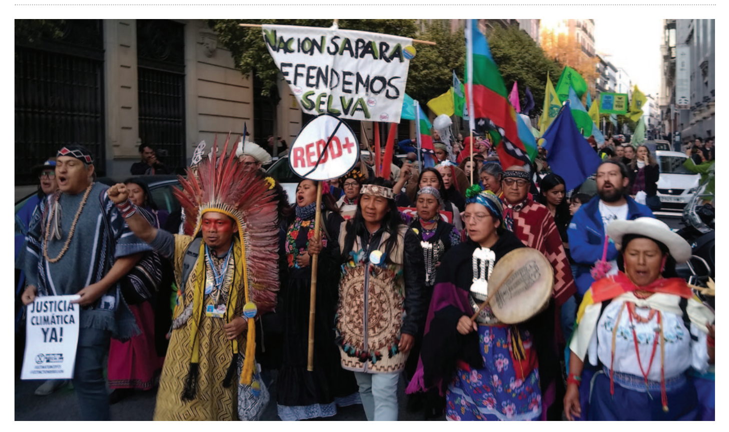
Indigenous leaders protest carbon pricing mechanisms in Article 6, REDD+ and other false solutions, in Madrid at the global climate march during the UNFCCC COP 25 meeting in December 2019.

It is clear that there is a huge economic incentive to ignore all the science presented here.