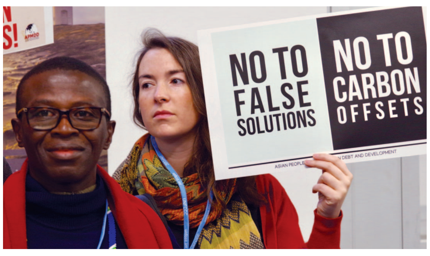
Climate Justice allies protest against threats to food, land and water at COP24 in 2018.

Carbon markets were established for trading in invisible atoms of carbon and molecules of carbon dioxide. In carbon markets, entities — governments, corporations, and individuals — can buy and sell carbon in the form of either avoided greenhouse gas emissions (for example, through taking a coal power plant offline and reducing demand and/or switching to renewable energy sources) or carbon removals (planting trees or restoring ecosystems).