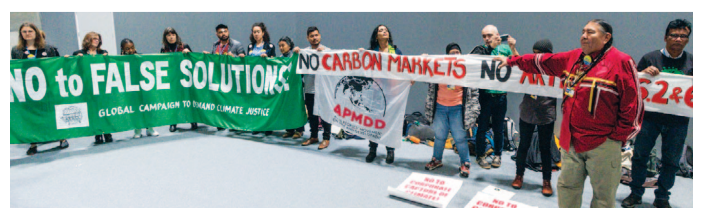
Activists protest carbon markets inside the COP25 climate negotiations in Madrid in December 2019.

There are numerous processes under way to bring nature into carbon markets to satisfy "needs" generated by the adoption of "net zero" pledges, targets, and rationales. These include the voluntary processes described above with the Taskforce on Scaling up Voluntary Carbon Markets (TSVCM) and formal intergovernmental negotiating processes, in particular under the UN Convention on Biological Diversity (CBD) and the UN Framework Convention on Climate Change (UNFCCC).<sup>34</sup>