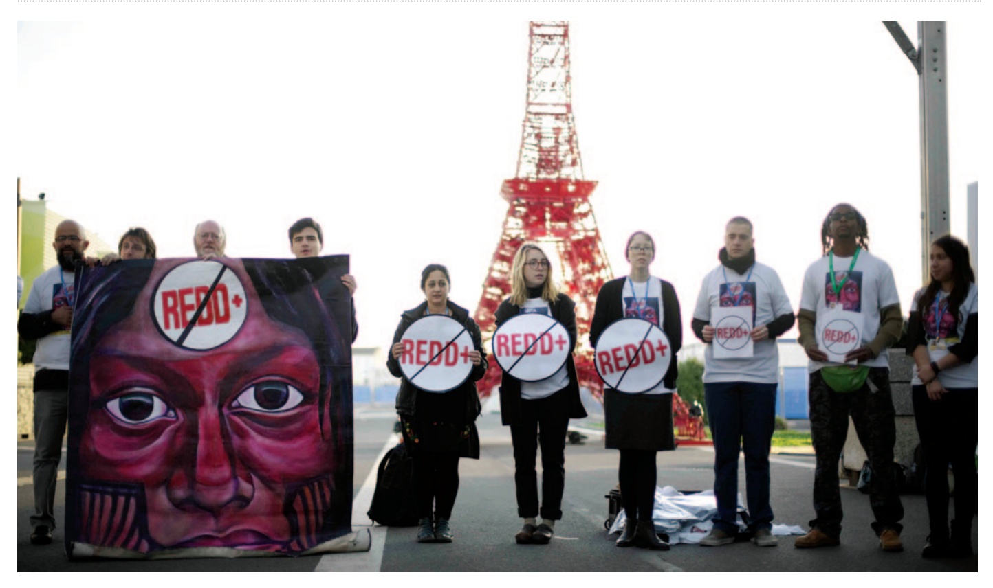
Activists protest REDD and land grabs ahead of the signing of the Paris Agreement at the COP21 climate negotiations in Paris in December 2015.

National governments are also setting "net zero" targets, as part of the actions they are taking in the context of the Paris Agreement, often in the context of their nationally determined contributions (NDCs). The strategies for fulfilling these are more varied than using offsets bought on the carbon market.