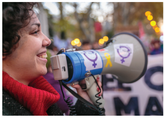
Marching for the climate at COP 25 in Madrid, Spain 2019

Coups d'état and dictatorships must be overturned, and all necessary measures must be taken to prevent furtherattacks on democracy aimed at enforcing the rule of transnational corporations, national economic powers and new neo-colonialist and imperialist arrangements. Right wing and oppressive governments who are using this tragic situation to increase militarisation of our societies and territories and impose surveillance tactics and techniques must be stopped.