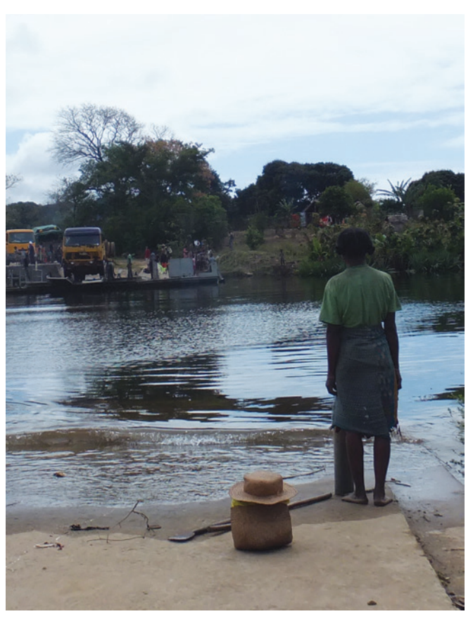
World Rainforest Movement / Re:Common

In essence, biodiversity offsetting and similar compensation offset schemes allow more pollution and destruction today on the promise to restore or prevent planned destruction elsewhere, in future. Offsetting leads to more, not less ecological destruction, causes more pollution, and amounts to a double land grab because corporations end up controlling land use at two locations – the site they are destroying and the location they are claiming as offset. This is the case whether the offset is for biodiversity, carbon from land-based projects or forest restoration.