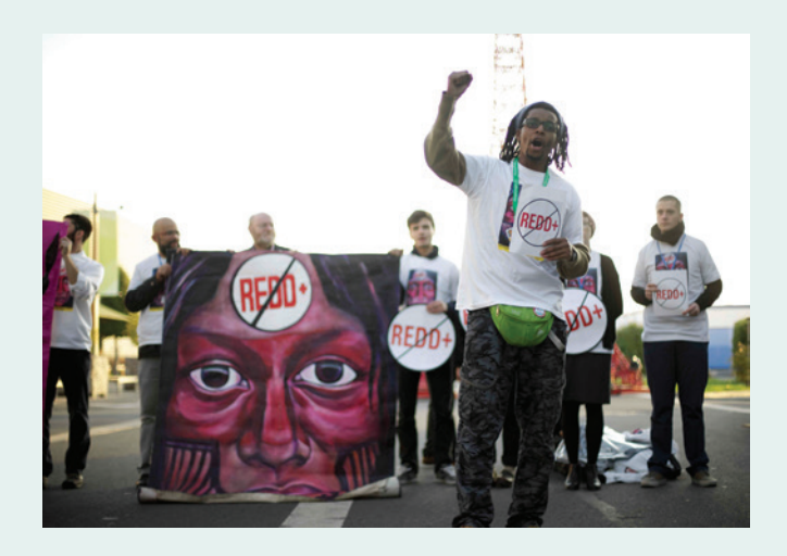
'No REDD' action at COP 21, Paris, 2015