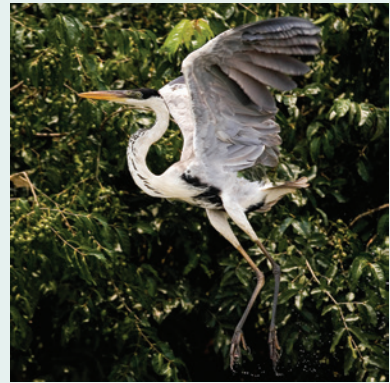
Heron fliying over Kikretum Village in Para, Brazil André Porto