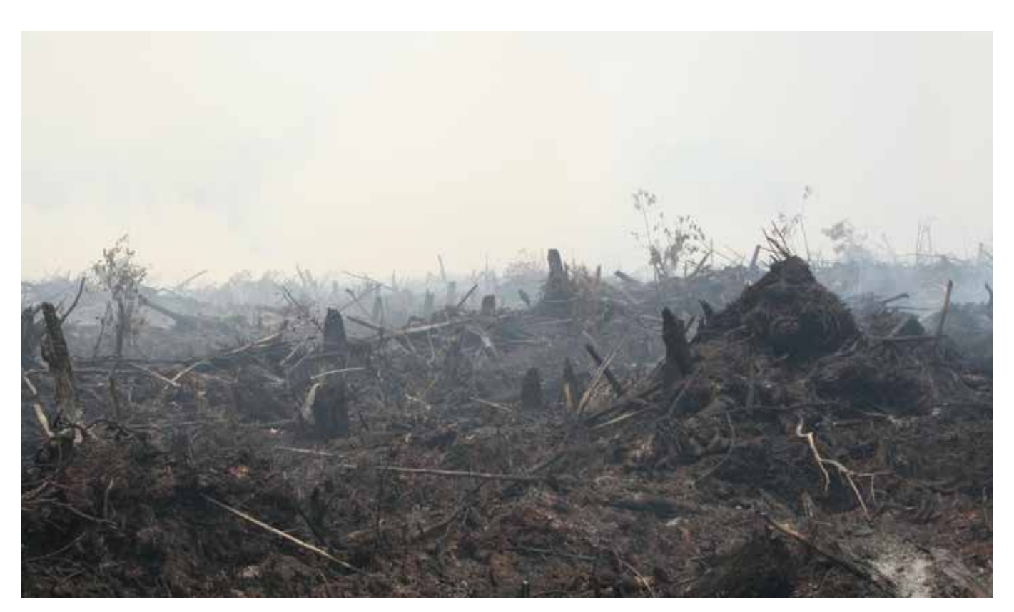
Forest fires in Indonesia

Sawit Watch (2015) predicted the amount of the oil palm plantation labors already reach 10,4 million people where 70% of them were labors without any work assurance (outsourcing)<sup>7</sup>.