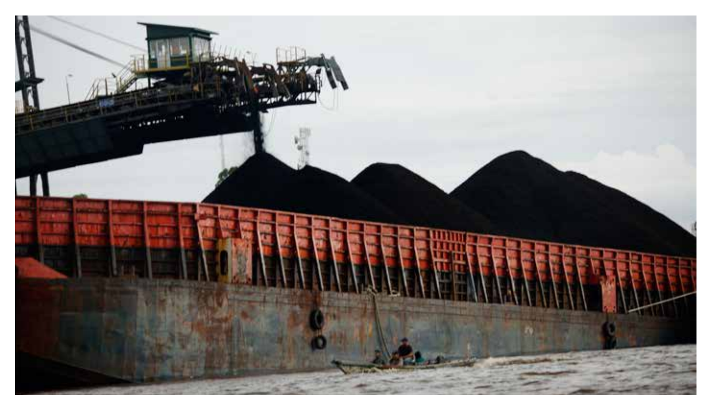
Coal transport on tributary of the Barito River

The forms and layers of violence experienced by women environmental human rights defenders are not the same experienced by men. Gender-based violence in the conflict over natural resources is a specific and typical violence experienced by women. Women defenders have a special vulnerability to various acts of intimidation, sexual harassment, prejudice, denial or rejection by