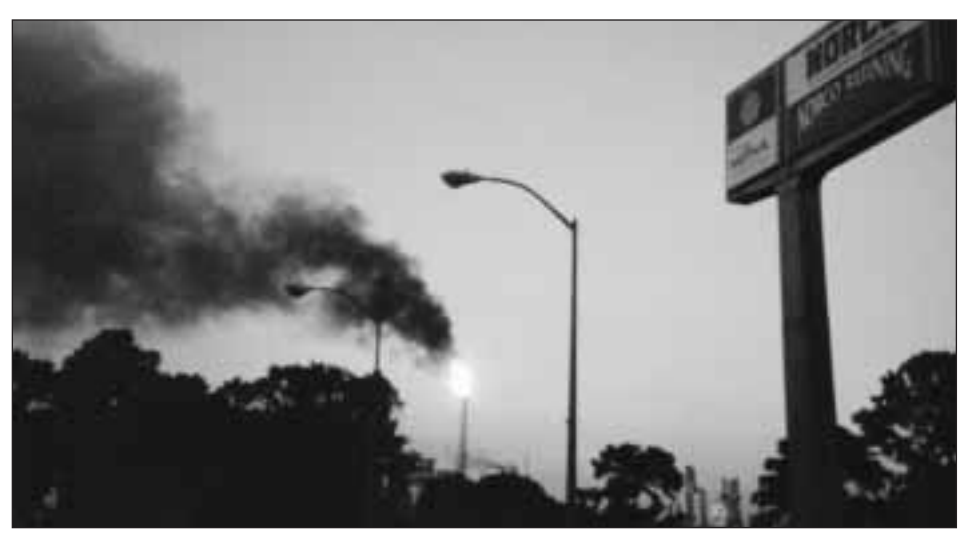
Shell Norco refinery flares again.

Norco, on the banks of the Mississippi River in Louisiana, is home to a large Shell oil refinery (now a joint venture called Motiva) and a Shell chemical facility. Norco is located in "Cancer Alley", a 136 km span of the Mississippi River where over 130 refineries and petrochemical facilities operate in communities that complain of high rates of cancer. The Norco neighbourhood of Diamond, where generations of close-knit African American families have lived since the 1700's, is locked between the two Shell facilities. In 2002, Diamond residents, organized as Concerned Citizens of Norco, compelled Shell to offer them relocation and reduce the pollution from its facilities. This unprecedented victory was a bittersweet one for residents, who left their homeland in order to find a healthy place to live.