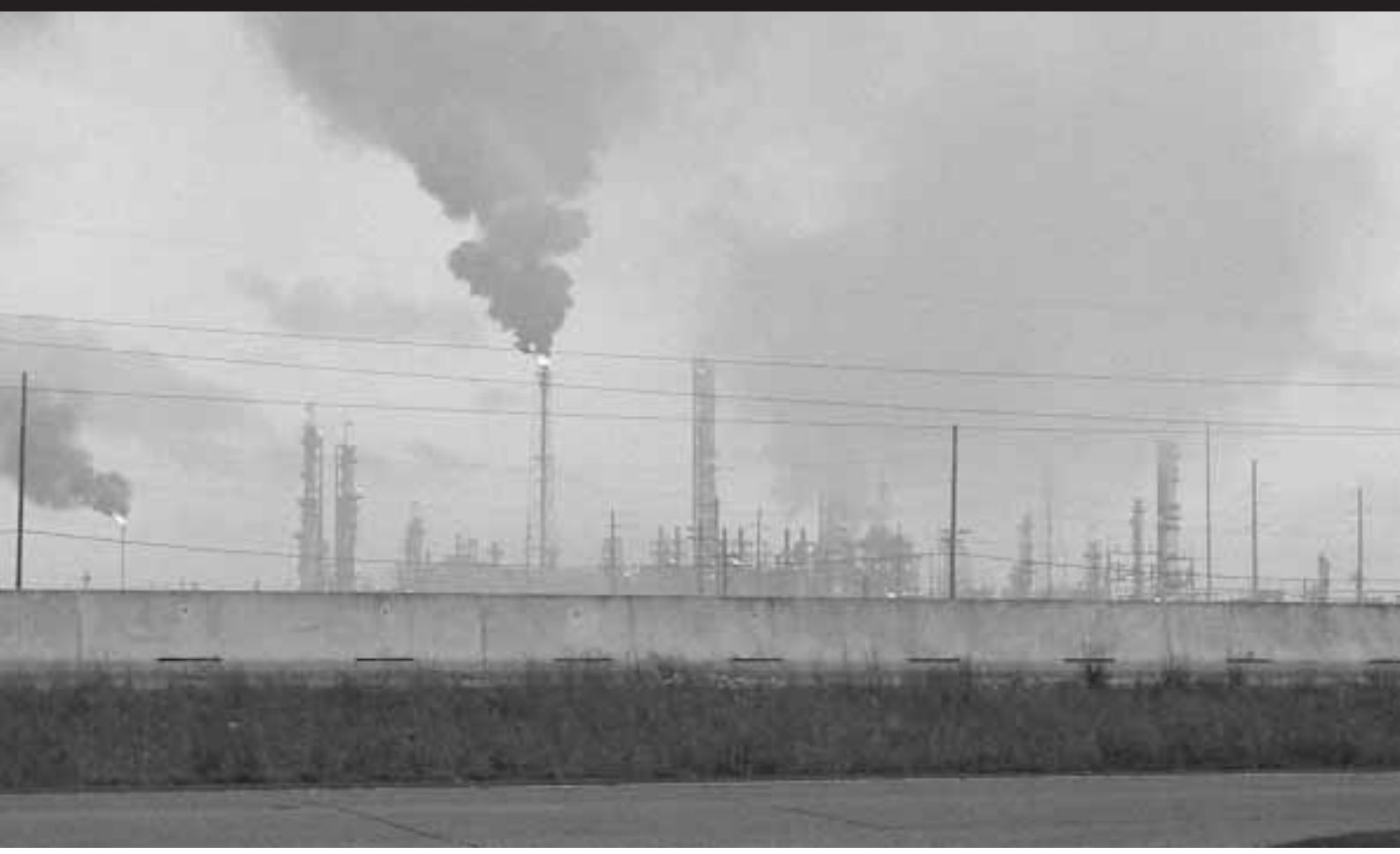
Bad air day in Port Arthur, April 14, 2003 (Hilton Kelley, Community In-power Development Association)