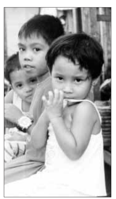
Children of Pandacan living in the shadow of Shell's huge fuel depot.

Exponentially exacerbating Shell's brash circumvention of local law requiring Shell to move its operations out of Pandacan is the fundamental fact that Shell's lease from the University of the Philippines for use of the property expired on May 3, 2000. The University was so outraged by Shell's failure to honor the terms of its lease agreement that it urged the Supreme Court to direct the mayor to enforce "the city ordinance banning oil companies from maintaining oil depots in Pandacan<sup>15</sup>". Warning the court that the presence of Shell's depot in Pandacan poses a "major threat to national security, considering the present escalation of terrorist activities"16, the University expressed concerns about its liability for "death and destruction" from Shell's continued presence<sup>17</sup>.