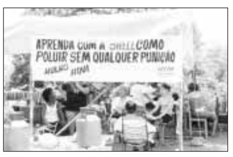
Shell neighbours hold a protest in Vila Carioca (Coletivo Alternative VerdE)

Since the filing of the complaint, both Shell and ExxonMobil have been the subject of investigations by the São Paulo State Department of Health and by the State Environmental Protection Agency. In 2002, the investigations revealed that Shell's large fuel-holding tanks located in Vila Carioca had been operating without a valid permit<sup>28</sup>. Governmental officials determined that the permit had expired in 1985, and ordered an immediate shutdown of the facility<sup>29</sup>. Although Shell was able to obtain a court order overturning