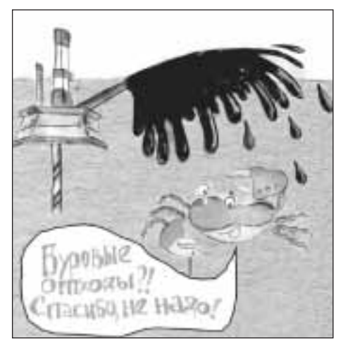
Cartoon depicting oil spill threat from drilling in Sakhalin (Sakhalin Environment Watch)