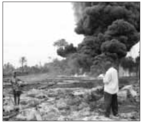
Rukpokwu, Nigeria, January 7th 2004, fire erupts in a high-pressure, 28-inch pipeline operated by SPDC, Shell's Nigeria affiliate, (copyright Stakeholder Democracy Network 2004)

Local people have suffered from decades of pollution as a result of oil spills and fires from Shell's rusting network of pipes. In early December 2003, a high pressure oil pipeline in Rukpokwu, which has been