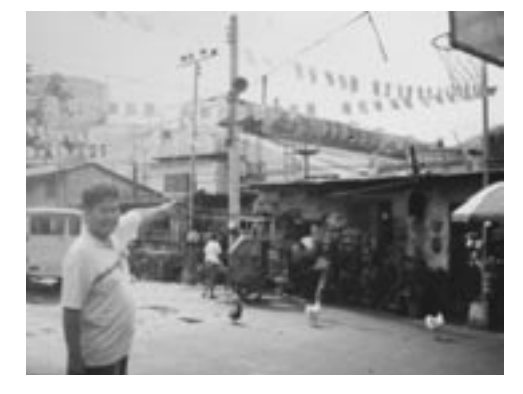
A street in Pandacan, Manila, with the oil and gas depots in the background.

"When there was a fire here, the employees of Shell were locked up inside. They didn't let them out. The first place they fought the fire was inside instead of outside. They locked the doors. I know because my husband was working there. Putting out the fire at the depot was given priority before extinguishing it at the residences." <sup>41</sup>