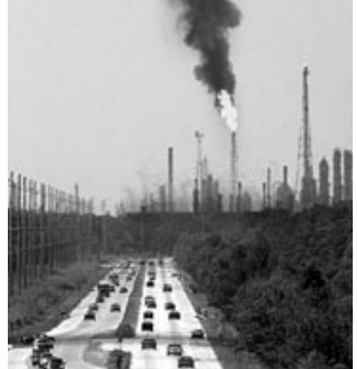
A flare from the Shell refinery in Norco which dominates the area.

"My older sister was 47 when she died of lupus and sclervederma. Her skin was hardened and discoloured and she was totally disfigured. She died six months after my mom."