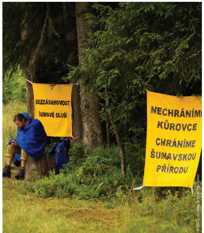
Hnutí Duha / Friends of the Earth Czech blockade to stop illegal logging in Šumava National Park.

The community of Pungești in Romania is defending their water and land from plans to develop shale gas reserves in their village. When Chevron brought in machinery to begin drilling in October 2013, the community organised a protest camp on private property with the permission of the landowner. Since the establishment of the protest camp, several members of the community have faced oppression, including arbitrary arrests and fines, beatings and threats of violence at the hands of the Romanian riot police. Threats have also been made against activists who went to Pungești to support the local struggle. These attacks culminated in the violent eviction of the protest camp in December 2013, resulting in injuries and mass arrests. After the eviction, Chevron returned to start its drilling activities. There was a second eviction one week later, with the authorities declaring the village an "area of special public protection", which enabled the escalation of police presence.