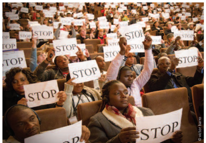
Participants of the World Forum on Human Rights and Sustainability in Nantes, France, 2013.

Recognising that system change is a long-term endeavour, environmental defenders must strengthen efforts to protect themselves and each other in the face of attacks. Stronger international campaigning to address global trends and link the sources of power to the violations that are committed in territories is needed in order to transform the system and achieve social and environmental justice. A tighter web of protection based on international solidarity is also required to keep environmental defenders safe.