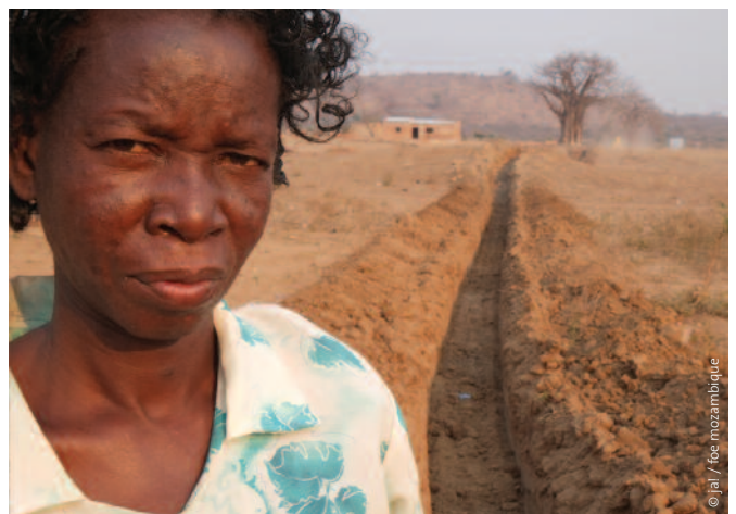
Community affected by mining giant Vale in Moatize, Tete province, Mozambique.

Friends of the Earth International is part of a broader movement calling for a treaty with legally binding rules for business and human rights and hopes this to be the outcome of the UNHRC sessions in June 2014, as an urgently needed further step to give affected communities and human rights defenders meaningful access to justice in their disputes with corporates.