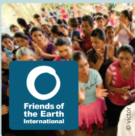
Women lead the resistance against the Exmingua mine, owned by Canadian Radius Gold Corporation, in San José del Golfo, Guatemala.

Challenging the corporate-led neoliberal production and consumption model and fostering an enabling environment for communities and nations to exercise their self-determination and pursue sustainable livelihoods will ensure the enjoyment of human rights and respect the rights of nature. Stronger international campaigning to address global trends and link the sources of corporate and institutional power to the violations that are committed in territories is needed in order to transform the system and achieve social and environmental justice. A tighter web of protection based on international solidarity is also required to keep environmental defenders safe.