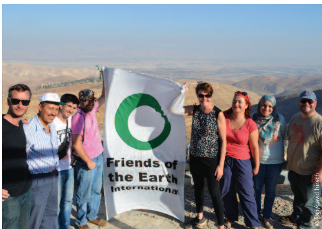
In October 2013 FoEI's Executive Committee visited PENGON / FoE Palestine. In the Occupied Palestinian Territories the efforts of environmental rights defenders are hampered by generalised repression of activists, with arbitrary arrests and raids on civil society organisations.

Violence against environmental defenders and violations of their rights do not take place in a vacuum. The neoliberal extractive model, which upholds corporate interests over the rights of people and nature, is part of the current context in which defenders work and which generates the conditions for acts of violence. Conflicts over territory and natural resources lead to violations of human rights and the rights of nature, as well as rights violations against environmental defenders. Corporate social responsibility strategies have failed to stop human rights violations and environmental destruction and instead have been used to cover up corporate abuses of communities, the environment, and of environmental defenders. Militarisation and counter-terrorism policies have created police states that punish instead of protect human rights defenders.