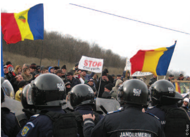
Standing in solidarity with communities resisting fracking, Romania.

Energy extraction projects are found in the Global North and South. In Europe and North America, there is a long and ongoing history of environmental defence against coal extraction. With the emergence of fracking, shale gas exploration, and the exploitation of tar sands, there is increasing community resistance to these projects and their impacts on the environment and people's livelihoods. This resistance is being met with repression and rights violations around the world, such as what took place in the protest camp in Romania. 38