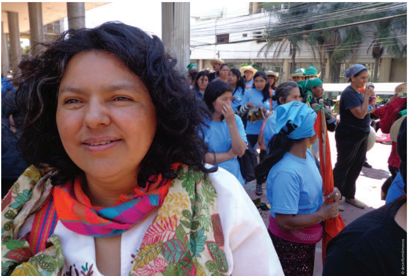
Bertha Cáceres, Coordinator of the Civic Council of Popular Indigenous Organisations of Honduras (COPINH) has been persecuted and had to flee from baseless arrest warrants.

"Women human rights defenders are more at risk of suffering certain forms of violence and other violations, prejudice, exclusion, and repudiation than their male counterparts."