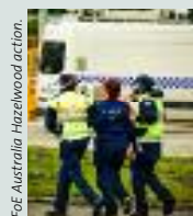
FoE Australia Hazelwood action.