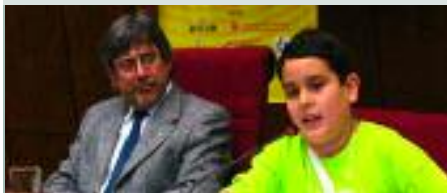
School children visit Paraguay's parliament.

with thanks to our funders: the c.s. mott foundation