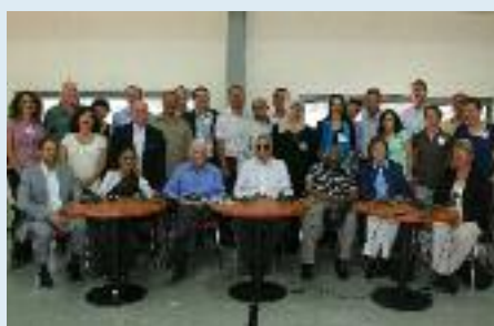
The Elders with FoE Middle East.

FoEI also hosts solidarity missions. In July 2009, for example, following the coup by Honduran President Manuel Zelaya, FoEI also sent an international mission to Honduras, together with Via Campesina. The mission consisted of a delegation of Central American peasants and representatives of several international social organizations. They visited Honduras to offer their support and solidarity to national social organizations calling for the return of the democratically elected president; many of these organizations have also been key players in the Movement of Victims Affected by Climate Change in Central America.