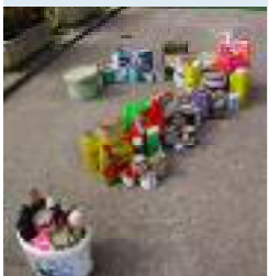
FoE Croatia toxic action.

The MDS has brought greater clarity to FoEI's membership areas. Priorities are the revision of membership criteria; the strengthening and involvement of member groups in the international programs; evaluation; expansion of the federation; the organization of FoEI membership issues, including the formal delegation of membership issues to regions; and decision-making and conflict resolution.