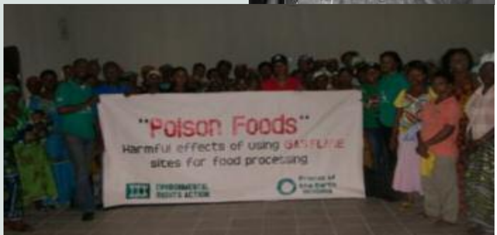
FoE Nigeria Poison Foods campaign.