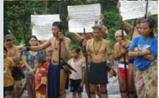
Communities protecting territories. FoE Malaysia.