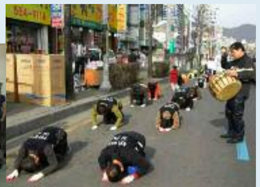
Three steps one bow action Incheon FoE South Korea/KFEM.