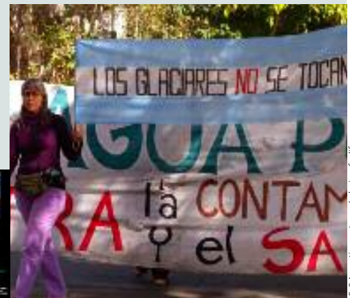
FoE Argentina water and glaciers for life.

with thanks to our funders: the Swedish society for nature conservation and the Dutch ministry of foreign affairs (dgis)