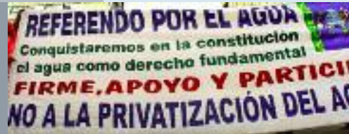
Colombian campaign for the right to water.