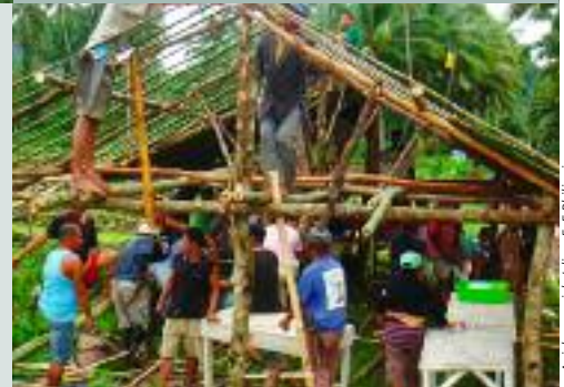
Anislagan picket line. FoE Philippines.

with thanks to our funders: the sigrid rausing trust