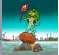
FoE Angry Mermaid cartoon.