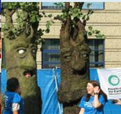
FoE forest campaigners at Bonn climate talks.