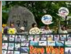
FoE South Korea/Ulsan KFEM Save Whale campaign.