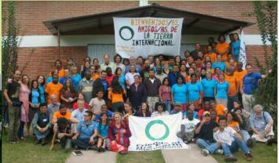
FoE BGM in Honduras.