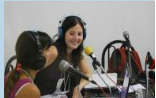
Radio Mundo Real

Real World Radio decentralized its production. It was able to include many more voices from different countries in Latin America, Asia and Africa (specifically in Argentina, Colombia, El Salvador, Guatemala, Palestine and Togo) by creating a network of correspondents both from Friends of the Earth groups and from other organizations, all of whom are dedicated to community communications.