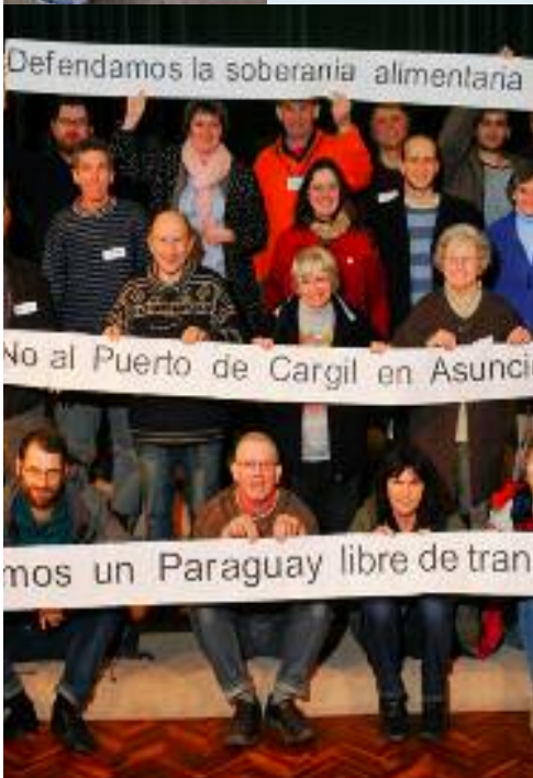
FoE EMVI local groups support FoE Paraguay.