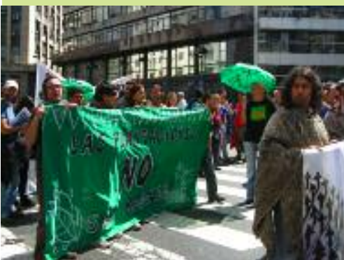
FoE groups at World Forestry Congress.

The program also participated in the 2009 World Social Forum in Belem, Brazil, co-hosting a workshop on plantations, market mechanisms and false solutions, with the Global Forest Coalition; and published "Community-based Forest Governance: from resistance to proposals for sustainable use."