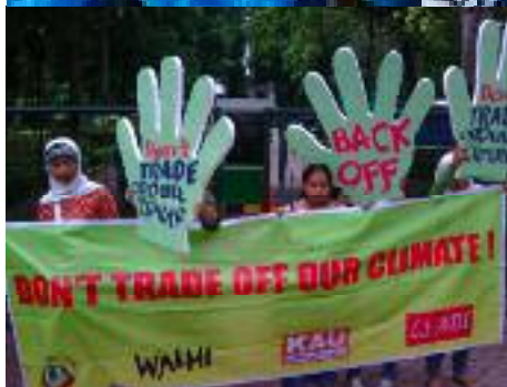
FoE Indonesia climate action.