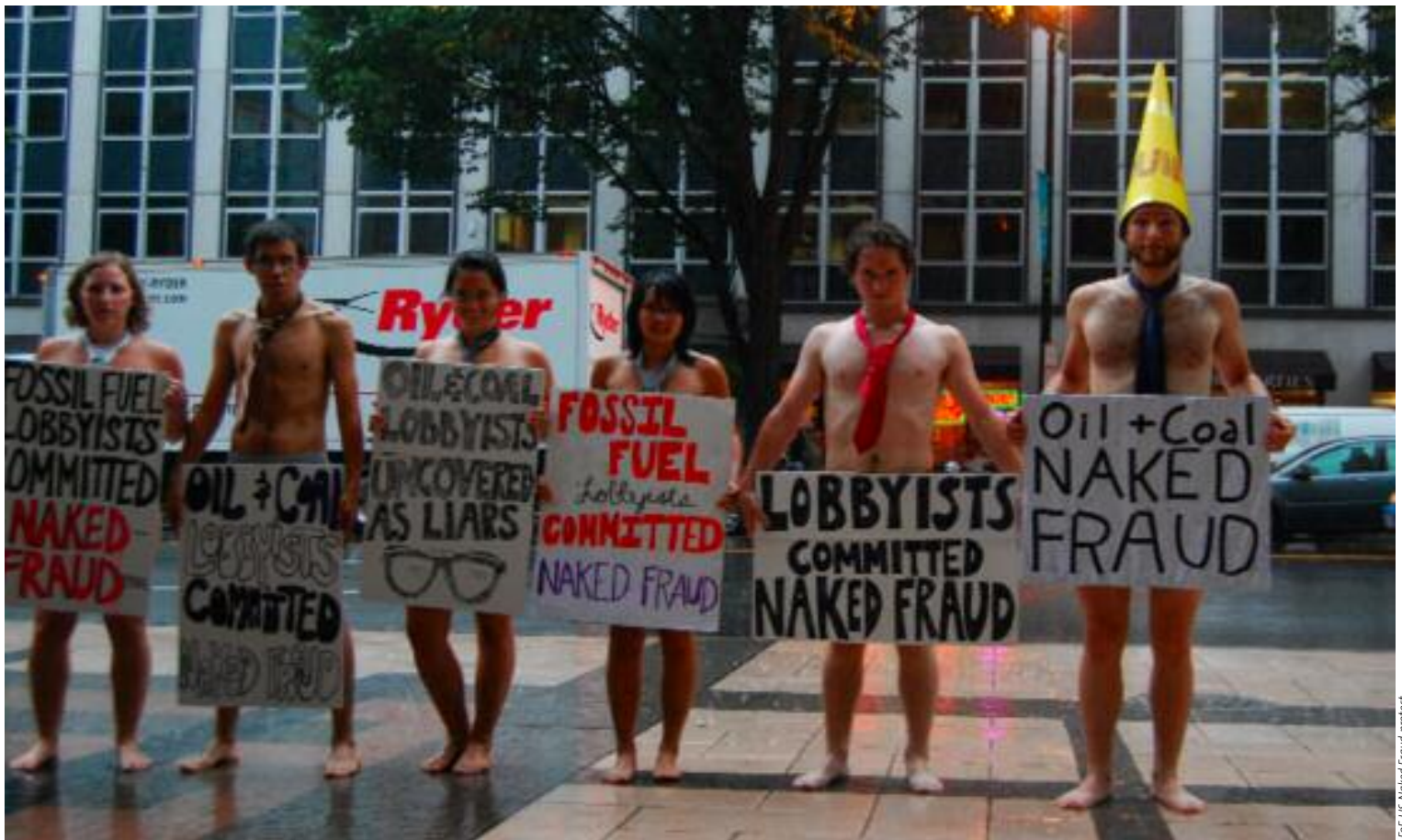
FoE US Naked Fraud protest.