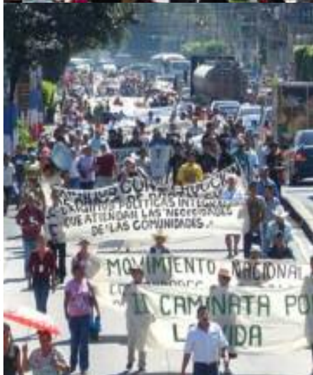
Fourth Continental Summit of Indigenous Peoples and Nationalities of Abya Yala.