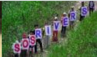
South Korea campaign to save rivers.