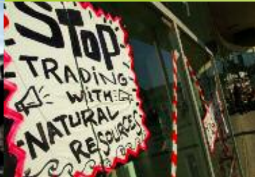
Barcelona climate talks.