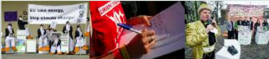
FoE Europe "penguin refugee camp."

Friends of the Earth also rejects nuclear power as a solution to climate change. As part of a wide movement including environment organizations, trade unions and churches, 50,000 people marched through the streets of Berlin declaring that it's time to switch off nuclear power. It was the biggest antinuclear demonstration in Germany since Chernobyl, and sent a clear message to politicians that nuclear power is not a solution to energy security or climate change.