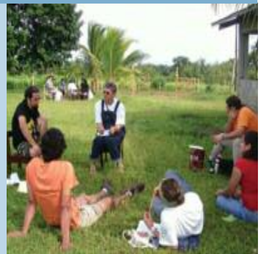
FoE Costa Rica hosts sustainability school.

with thanks to our funders: the isvara foundation