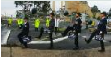
FoE Australia Hazelwood action.

with thanks to our funders: the dutch ministry of foreign affairs (dgis)