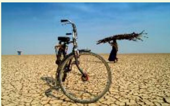
FoEI photography competition winner.

Friends of the Earth International ran its fourth annual photo competition in 2009 on the theme of “Our Biodiversity, Our Lives” to mark the occasion of the United Nations’ International Year of Biodiversity in 2010. More than 1,200 photos were received from 79 countries around the world, from amateur and professional photographers ranging in age from 11 to 73 years old. You can see the winning photographs here: www.foei.org/en/resources/photographs/biodiversity-lost