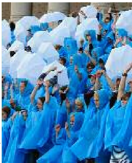
FoE Finland flood action.

We published a substantial number of policy proposals and analyses in the run-up to the COP-15 UNFCCC in Copenhagen, in December 2009. This included an ethical climate finance criteria matrix, which provided governments with a set of criteria for judging climate financing mechanisms proposed during negotiations.