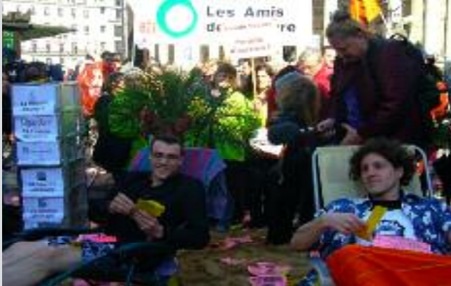
FoE Europe financial crisis action.

The Economic Justice-Resisting Neoliberalism Program's objective is to develop sustainable societies by building people's power and dismantling corporate power, stopping corporate-led neo-liberalism and globalization, and challenging the institutions and governments that promote unequal and unsustainable economic systems.