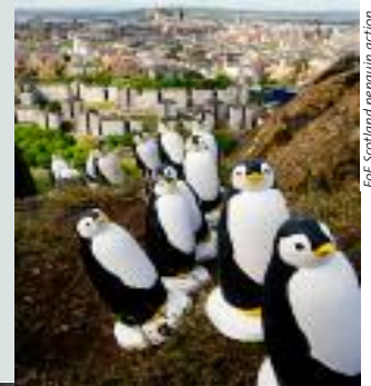
FoE Scotland penguin action.

FoE Germany/BUND, together with human rights and development NGOs, also delivered 10,000 signatures to the Colombian Embassy in Berlin, to protest against continuing human rights abuses in Colombia, which the expansion of the palm oil industry is fuelling.