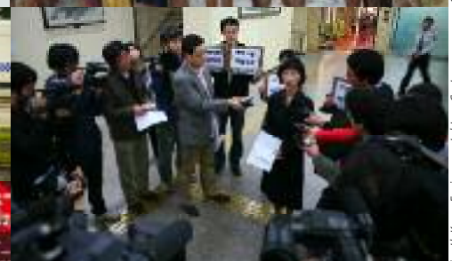
South Korea Environmental Law Center