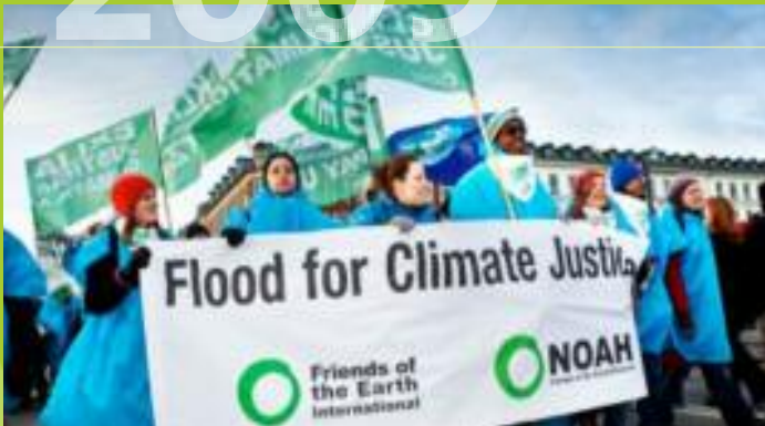
FoEI Flood Action in Copenhagen, Christoffer Askman.