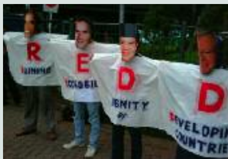
FoE Indonesia anti-REDD action.

with thanks to our funders: the dutch ministry of foreign affairs (dgis)