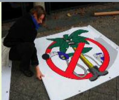
FoE Germany palm oil protest.

Friends of the Earth also filed a complaint with the UK Advertising Standards Authority (ASA) against the Malaysian Palm Oil Council for falsely advertising that palm oil is the "only product able to sustainably and efficiently meet a larger portion of the world's increasing demand for oil crop-based consumer goods, foodstuffs and biofuels." The ASA ruled that this statement was misleading, as was the Malaysian Palm Oil Council's claim that palm oil contributes to alleviation of poverty.