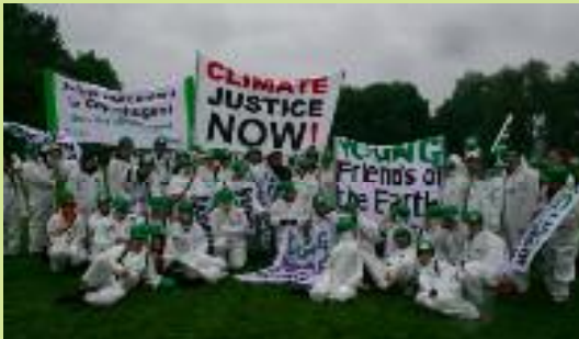
Young FoE activists in Bonn.