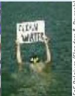
FoE Belgium (Flanders & Brussels).

The Forests and Biodiversity program's focus on strengthening and promoting sustainable local initiatives means that some of its key activities and successes occur at the national level.