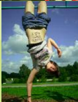
FoE Belgium (Flanders & Brussels).