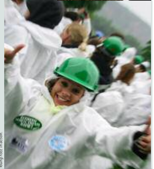
Young FoEE in action.