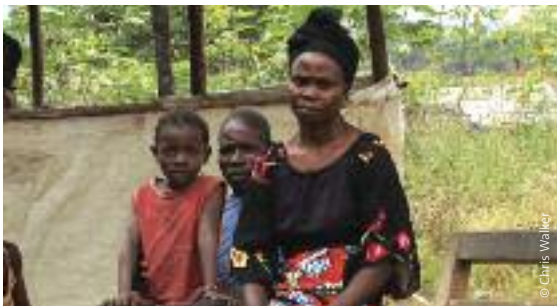
Congolese villagers living near M'Boundi.

In Tanzania, thousands of rice and maize farmers were forced off their land in 2009 or have been threatened with eviction to make way for sugarcane plantations in several parts of the country. More than 1,000 rice farmers had to leave their land on the Usangu plains in 2009, leading to widespread disputes. A similar number faced eviction from the Wami Basin to make way for a planned plantation 58 . European companies, backed by the EU Energy Initiative and UK and US aid money are behind a number of the developments 59 . Jatropha and sunflower plantations have also been proposed. Protests from the farmers have led the Tanzanian government to rethink its approach to agrofuels 60 .