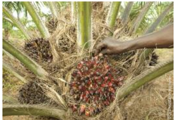
Palm oil fruit.