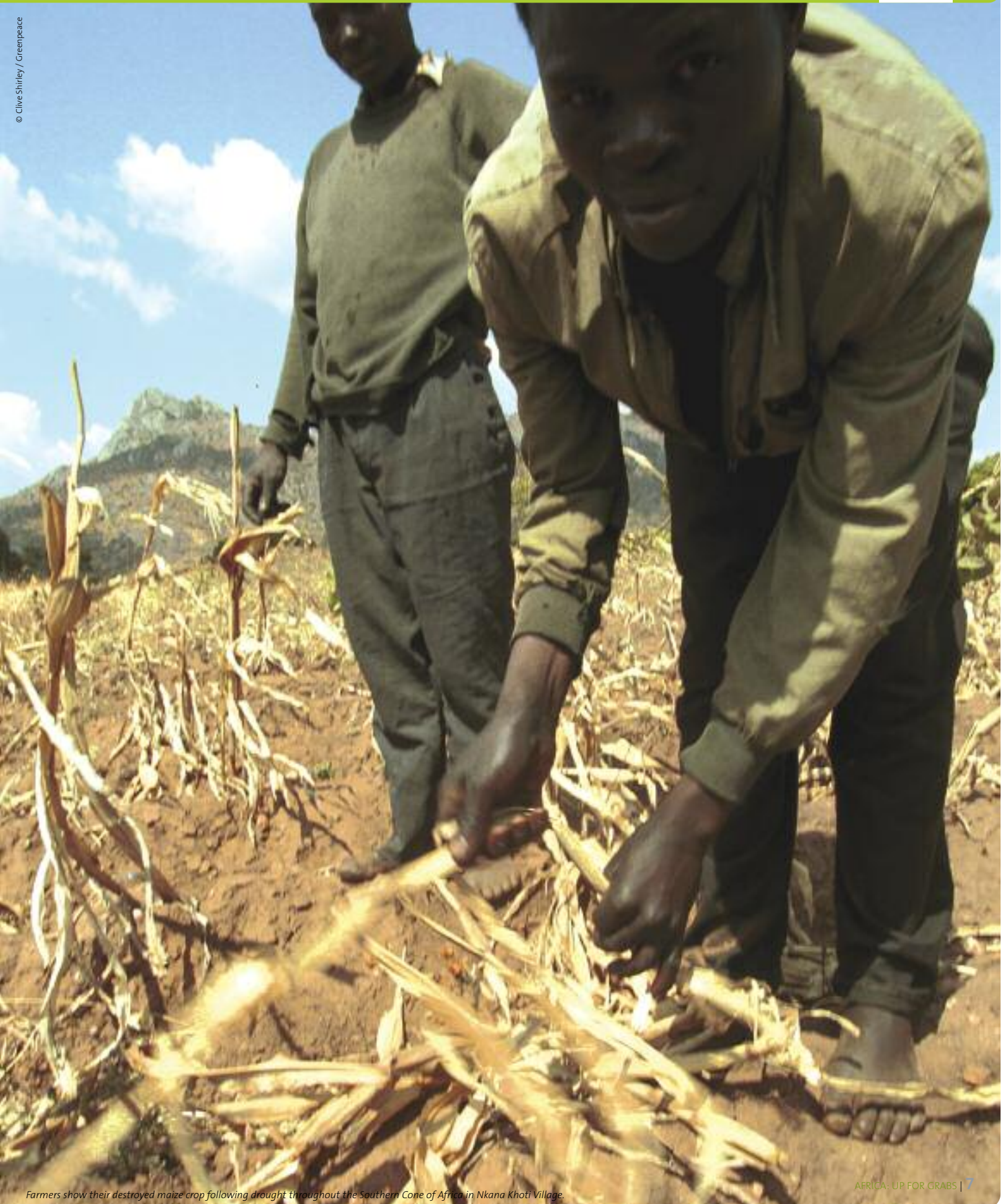
Farmers show their destroyed maize crop following drought throughout the Southern Cone of Africa in Nkana Khoti Village.