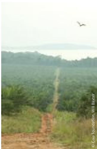
BIDCO palm oil plantation in Kalangala Islands, Lake Victoria, Uganda.

These issues need to be assessed objectively. We should not accept these arguments without subjecting them to empirical analysis. The rationale behind this research is anchored on this premise. It looks at the spread of agrofuel production across Africa and highlights the social, economic, health and environmental concerns found.