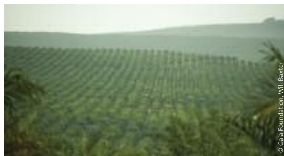
Palm oil plantations in Kalangala Islands, Lake Victoria, Uganda

In doing so, it draws on a number of studies, press reports and local research. There is however a lack of detailed public information about land deals and ownership in most parts of Africa and providing a full picture of the situation is close to impossible. The political situation in a number of Africa countries also makes it very difficult for civil society and members of the public to obtain official information or to speak openly. This report is therefore only a snapshot based on what information is publicly available. Increased transparency and more research are urgently required.