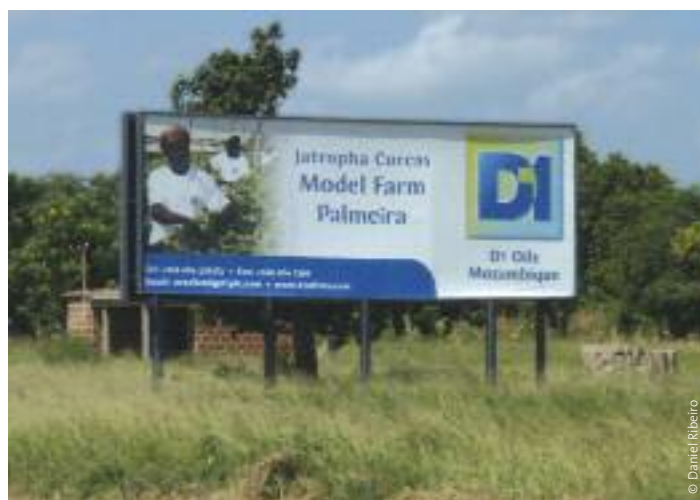
Example of Jatropha project in Mozambique. D1 Oils – Maputo.

D1 Oils’ joint venture with oil giant BP also came to an end when BP pulled out in 2009 121 .