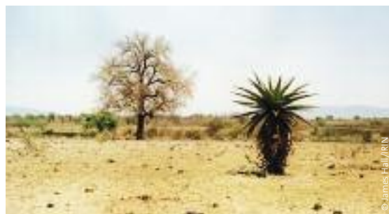
Desertification: former eastern low level crop land, Swaziland.

In Nigeria, plans for large sugar-cane plantations in Gombe State have raised concerns over pesticide use and the impact on surrounding farmland 99 .