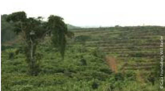
BIDCO palm oil plantation in Kalangala Islands, Lake Victoria, Uganda.

Just as African economies have seen fossil fuels and other natural resources exploited for the benefit of other countries, there is a risk that agrofuels will be exported abroad with minimal benefit for local communities and national economies. Countries will be left with depleted soils, rivers that have been drained and forests that have been destroyed.