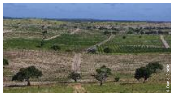
Energem Plantation, Dezeve community, Bilene District in Mozambique.

Senegal has introduced a National Biofuel Programme and Nigeria has set a national target for using up to 10% home-grown agrofuel in transport fuel by 2020. A number of other countries including Mozambique and Ghana also appear to have embraced agrofuels with enthusiasm. Mozambique is not unusual in seeing agrofuels, particularly jatropha, as a way of reducing dependence on fuel imports 35 .