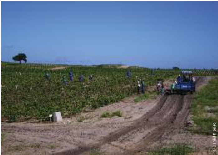
Energem laborers, Dzeve community, Bilene District in Mozambique.

In some cases, foreign companies are reported to be abusing local laws intended to protect workers rights. Sun Biofuels, also in Mozambique, employs 430 workers on jatropha plantations, with workers reportedly employed to work a 45 hour week, with longer days than the law permits 86 .