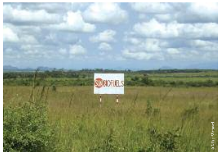
Examples of Jatropha projects in Mozambique. SunBiofuels – Manica.