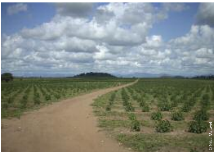
Sun Biofuels jatropha plantation.