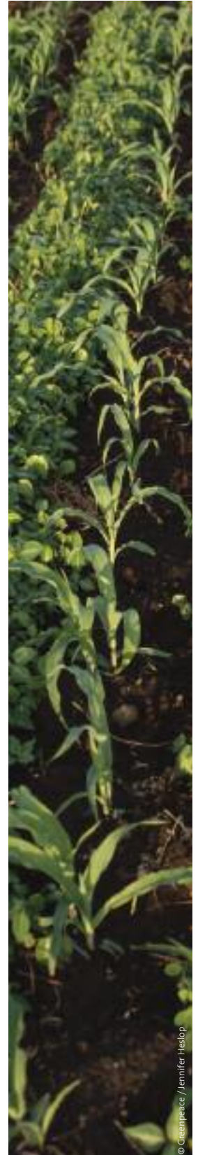
Young crops of maize and silver leaf, Suba District, Kenya.

Protection of farm workers: Agricultural waged workers should be provided with adequate protection and their fundamental human and labour rights should be stipulated in legislation and enforced in practice, consistent with the applicable ILO instruments. Increasing protection would contribute to enhancing their ability and that of their families to procure access to sufficient and adequate food.