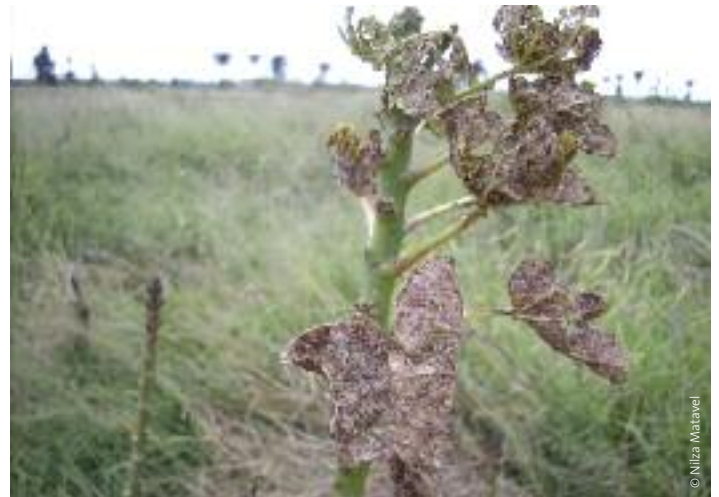
Jatropha with pests, Moamba district in Mozambique.

Farmers from the União Nacional de Camponeses (UNAC) in Mozambique who have been growing jatropha report slow growth rates, low yields and problems with pests 89 .