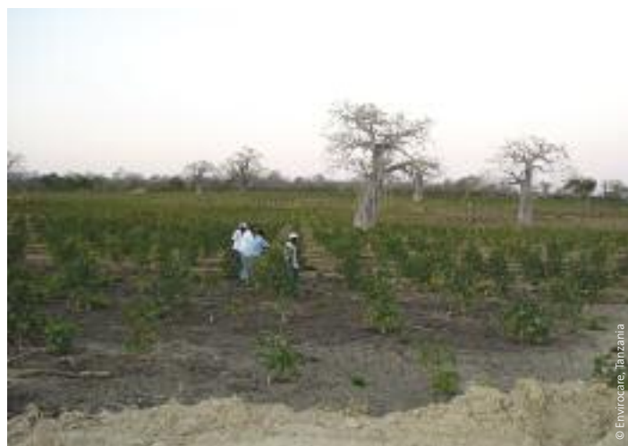
Bioshape jatropha farm in Kilwa, Tanzania.

Even more key is the availability of fertile land with available water supplies. Although there are claims that agrofuel crops such as jatropha and sweet sorghum grow well on marginal land, many of the “land grabs” for agrofuel crops involve land previously used for agriculture.