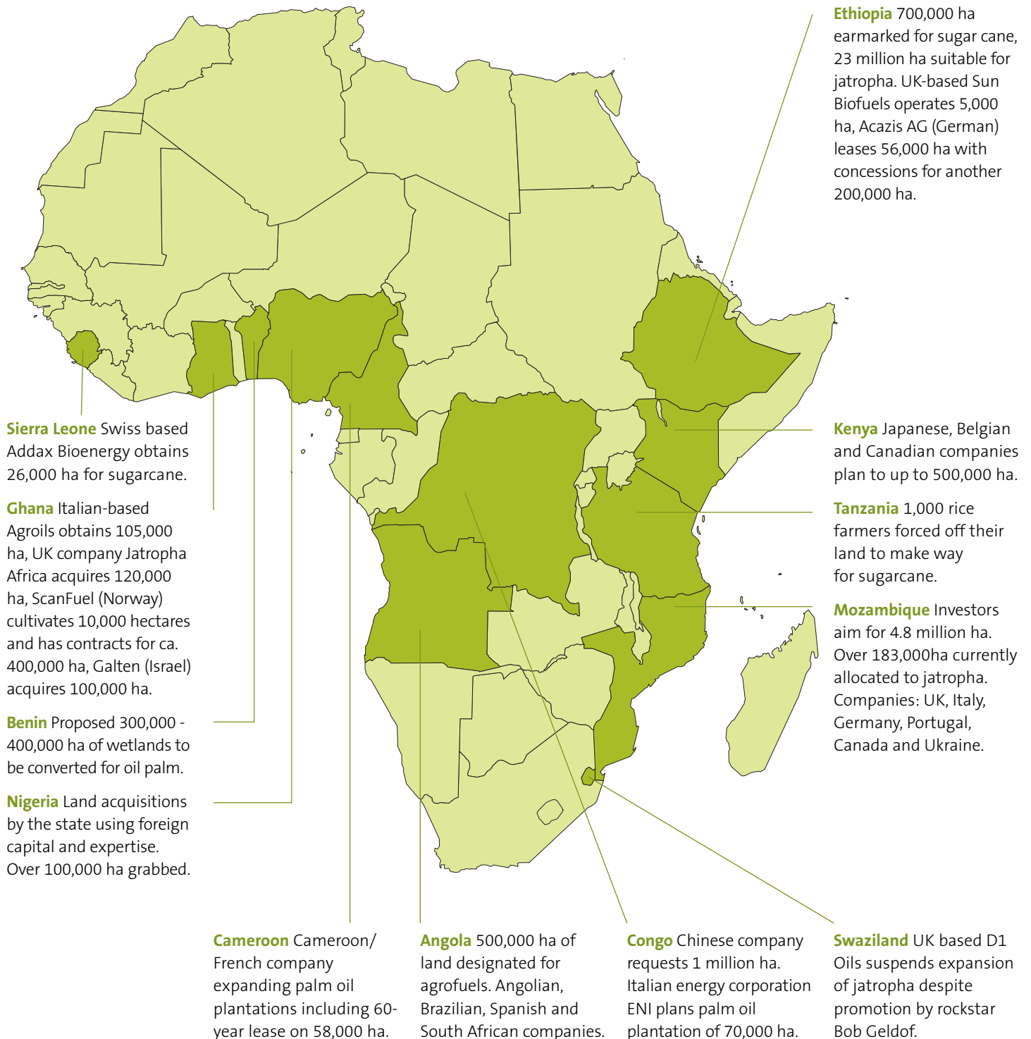
Figure 1. Reported cases of land grabbing and agrofuel developments across Africa