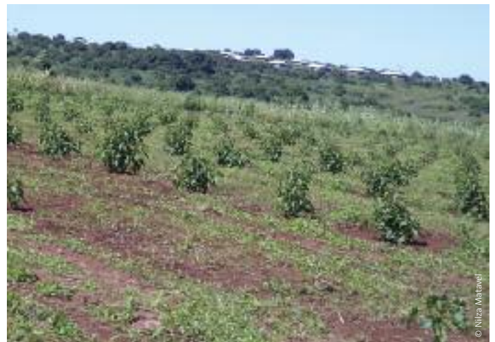
MoçamGalp plantation in Mozambique.

The Intergovernmental Panel on Climate Change has predicted that parts of Africa are likely to become drier, with less reliable rainfall as a result of climate change. The area of African land classified as “dry” could increase by up to 90 million ha. The lack of water will affect crop yields and make livestock farming impossible in some areas 109 .