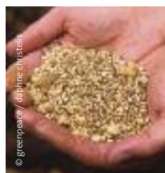
Feed for dairy cattle.