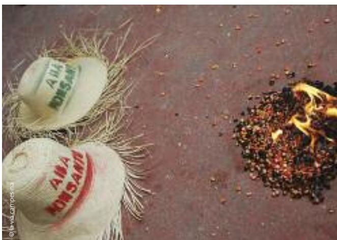
Haitian protests against Monsanto and GMOs.