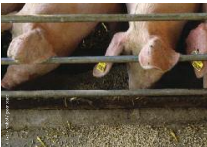
Pigs feeding on animal feed that contains GM soya beans.

This 70-page decision was reached after arguments were considered from both patent owners and their opponents, concerning attempts to patent the biological processes of tomato and broccoli plants. This decision delivers a major blow to the biotech corporations, who have been using broad legal definitions of patents to gain control over farming and the food chain. Nevertheless conventionally bred plants and animals can still be patented in Europe, since the EPO decision only excludes processes for breeding; it does not concern itself with patents on plants and animals more generally. Still, this is a success for the international coalition against patents on seeds, which is supported globally by over 300 NGOs and farmers' organisations. 34