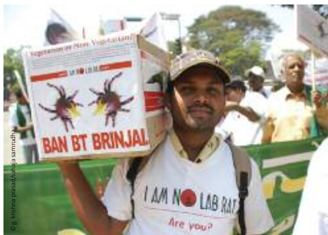
Carrying petitions against Bt Brinjal.