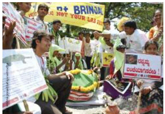
Action against Bt Brinjal, India.