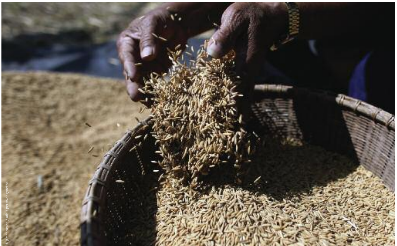
Harvesting organic rice

Food sovereignty puts those who produce, distribute and consume food at the heart of food systems and policies, rather than the demands of markets and corporations. It defends the interests and inclusion of the next generation. It offers an alternative to the current trade and food regime, and directions for food, farming, pastoral and fisheries systems determined by local producers. Food sovereignty prioritises local and national economies and markets and empowers peasant and small-scale sustainable farmer-driven agriculture, artisanal fishing, pastoralist-led grazing, and food production, distribution and consumption based on environmental, social and economic sustainability.