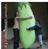
Children hugging a brinjal, India.

Seed corporations like Monsanto and Bayer are also carrying out field trials on herbicide tolerant cotton and maize, despite the superweed crisis that has unravelled in the USA. 165