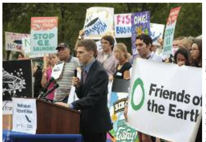
Friends of the Earth action against GM salmon in front of the White House, USA

The main argument for such a GM pig is to protect water resources. Run-off from pig manure that contaminates water is an expensive problem faced by large-scale, industrial hog producers. These ‘enviropigs’, if approved, would allow the few giant hog production corporations that run factory farms to continue to raise large numbers of pigs, fed on grain, in small confined areas.