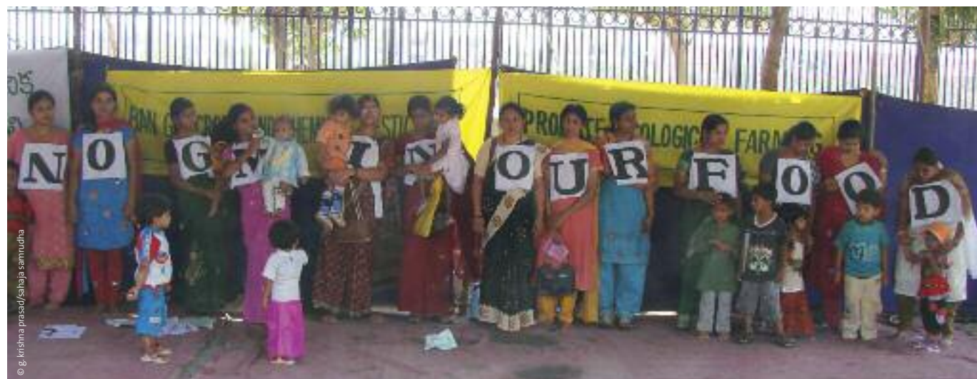
Mothers against GM food, India.