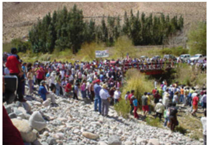
Above: Protest against Barrick Gold's Pascua Lama project.

We have mining projects like Pascua Lama which will affect this basin, which will affect the water, which will affect all this land. They can carry out a thousand studies and prove technically that it won't, but those of us who live here know it's not so.