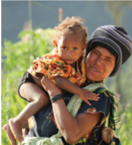
Barrick Gold's mine in Porgera, Papua New Guinea has been subject to international attention in regards to human rights violations, particularly against women who have been gang raped by Barrick's security guards.