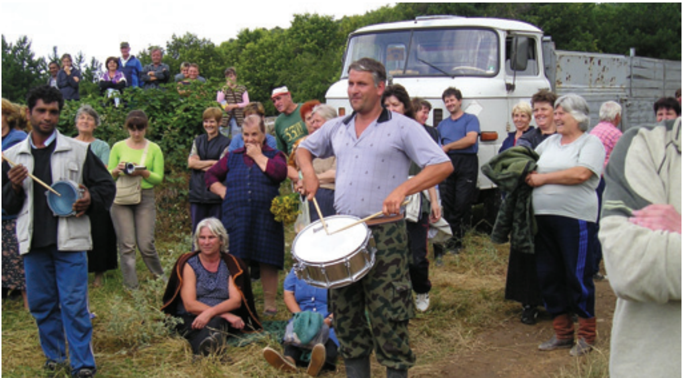
Community from Popintsi village in Bulgaria at the barricade against Euromax Resources.