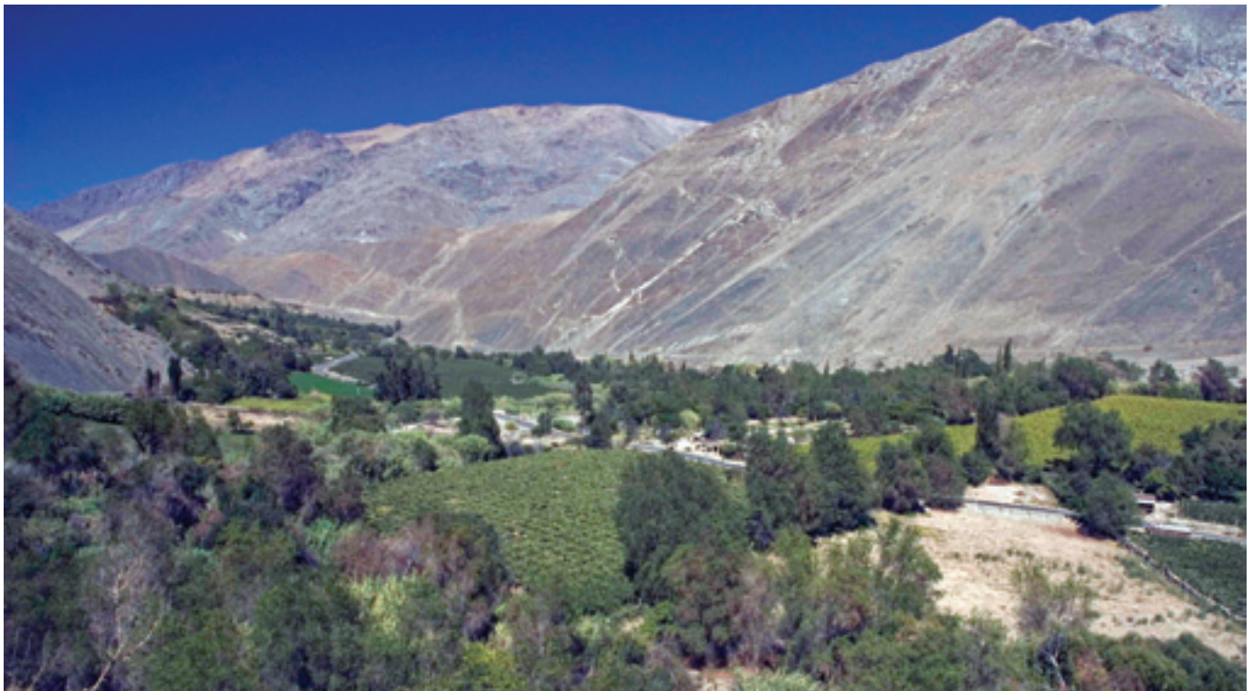
The Huasco Valley, Chile. Community in both Chile and Argentina are resisting against Barrick Gold's Pascua Lama gold mining project.