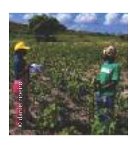
Interview with Energem laborers, Dzeve community, Bilene District.