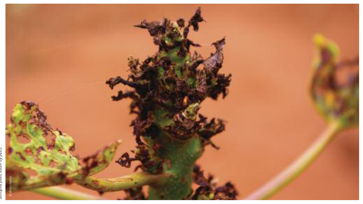
atropha plant eaten by pests.

The presence of large-scale agrofuel investors and the methods employed by them to access sufficient land to establish jatropha projects has also come to the fore as a problem. Major concerns include a lack of public participation in decision-making about land use, disregard for local culture and practices, false promises, corruption, land conflicts and resource grabs.