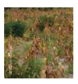
A failed subsistence crop of maize mixed with Jatropha.