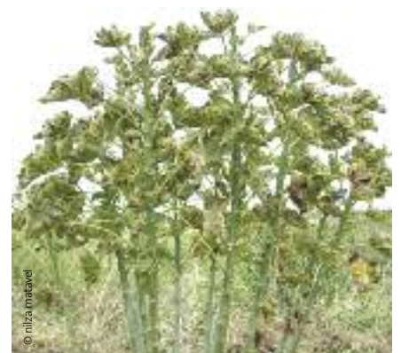
tropha curcas - Moamba District.

The links between these companies, and their connections with local companies and influential government individuals, are especially difficult to disentangle. Furthermore, even when information is obtained, it is often excessively complex, outdated or incorrect. It is thus extremely difficult to assess the different players in the jatropha industry in Mozambique.