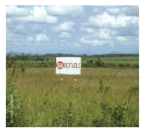
un Biofuels, Manica.

However, a persistently high level of corruption is by far the main problem. In addition to preventing communities from defending the land that they live and depend upon, it creates a sense of insecurity and lack of ownership amongst the rural poor, whose sense of identity, culture and being is intricately linked to the land. This has led to individuals using land less sustainably and with less regard. In some interviews with communities<sup>3</sup> it was not uncommon to hear phrases such as, "Why protect what others are going to steal?" or, "It's mine until the government wants it," or, "I must take what I can from my land before it's stolen by others."