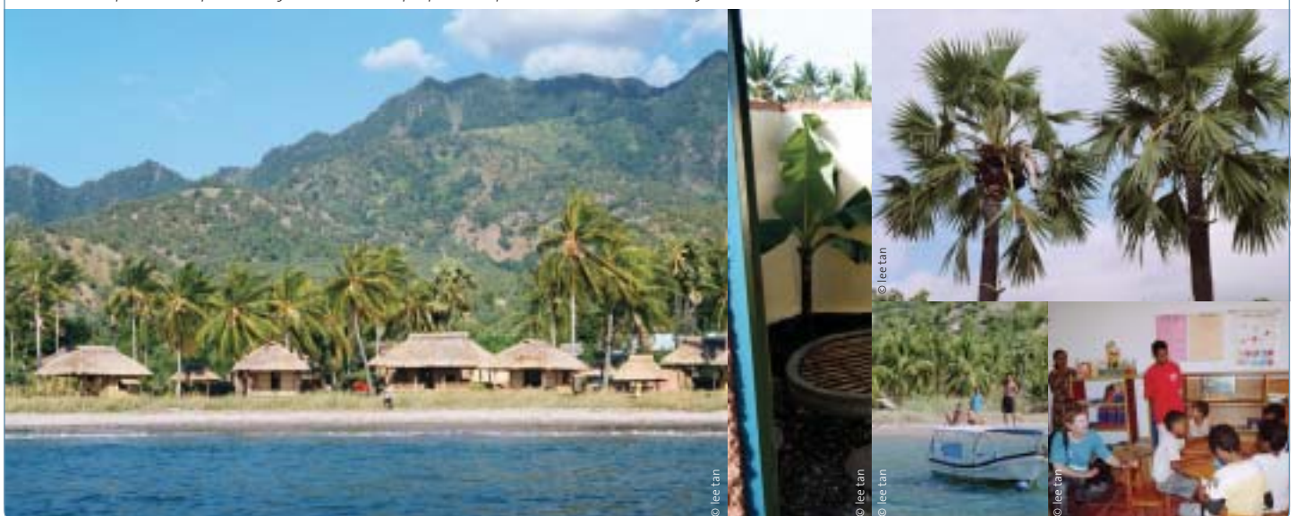
Eco huts, compost toilets, palm trees from which local people make palm wine, and a local library on Atauro island in Timor Leste.

The communities of Atauro are very proud of their achievements, which have attracted much interest within Timor Leste. They are living proof that a community-based approach facilitates ownership and control by local people, ensuring a sustainability which will outlive the project.