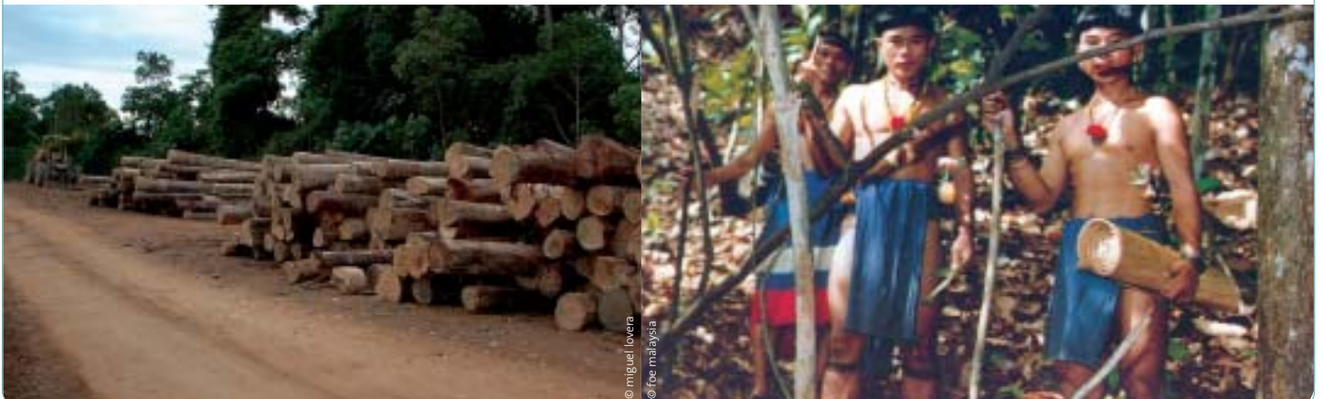
© miguel lovera © foe malaysia

Friends of the Earth Malaysia has cooperated with the Penan on several income-generating activities that do not endanger forest resources, including agro-forestry and timber production from native tree species. These economic initiatives have enabled the community to pay for education and medicine. The community mapping approach has since spread across Sarawak, resulting in important legal victories for many forest communities.