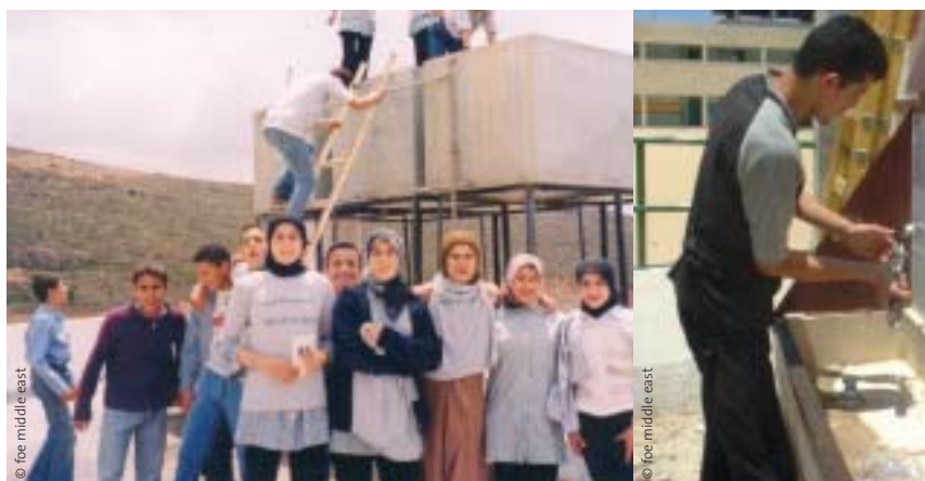
Children from a Palestinian village standing near the water tank of a water harvesting system.

Water harvesting devices to collect rain from rooftops, run-off from paved school yards, and excess water from drinking fountains have been fitted into school buildings in 11 communities. The stored water can then be used for flushing toilets, for irrigation and even for drinking in areas where there are serious water shortages. This innovative system has meant huge savings in fresh water use, and has brought water to schools that could otherwise not provide children with a regular supply of drinking water.