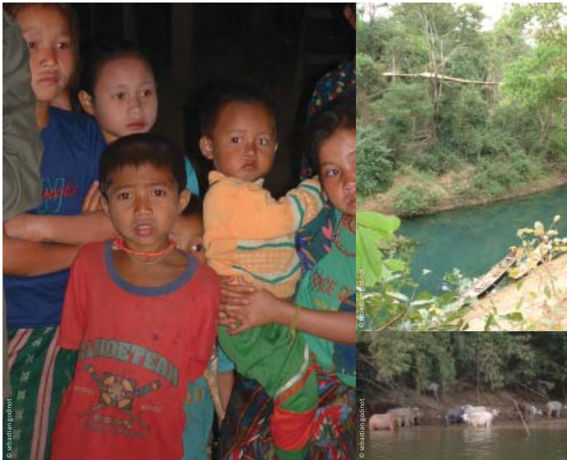
The people and nature that will be impacted by the Nam Theun dam.

expansion of a country's extractive industries sector"; and that "the World Bank Group does not appear to be set up to effectively facilitate and promote poverty alleviation through sustainable development in extractive industries in the countries it assists." In its March 2005 analysis of the reasons for Africa's economic woes, UK Premier Tony Blair's Commission for Africa concluded that: "Evidence shows that IMF and World Bank economic policy in the 1980s and early 1990s took little account of how these policies would potentially impact on poor people in Africa."