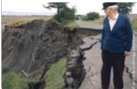
A public road used by school buses falls victim to the greed for more coal in Lanarkshire, Scotland.

Friends of the Earth Scotland runs an environmental justice course aimed at equipping people living in polluted communities with tools to challenge this injustice. Graduates have been active in a variety of fields, including planning issues, opencast coal mining, fish farming, industrial pollution, waste, recycling landfill sites, and sustainable development.